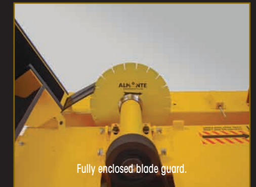
Fully enclosed blade guard.