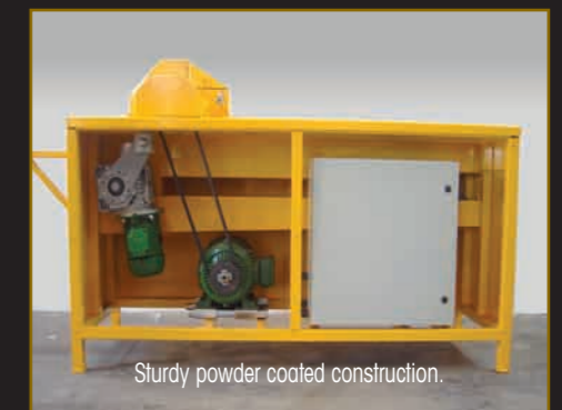
Sturdy powder coated construction.