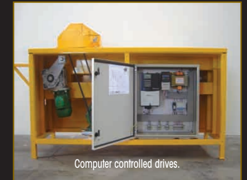
Computer controlled drives.