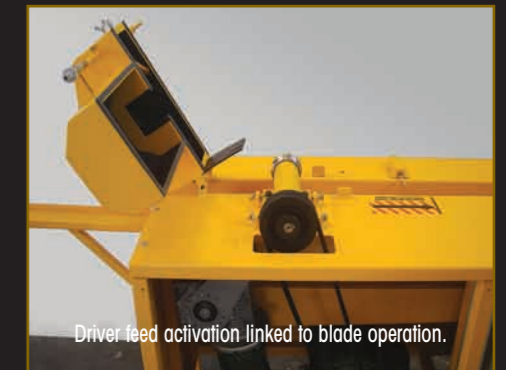
Driver feed activation linked to blade operation.